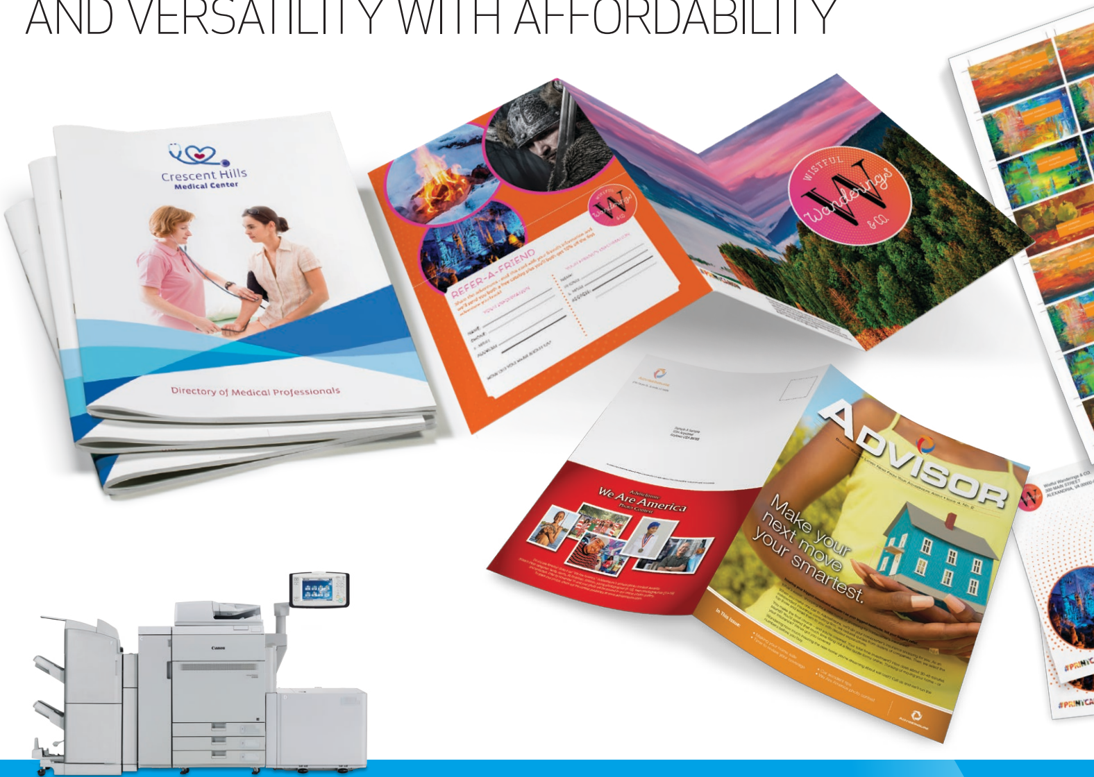
Engine shown with optional accessories.