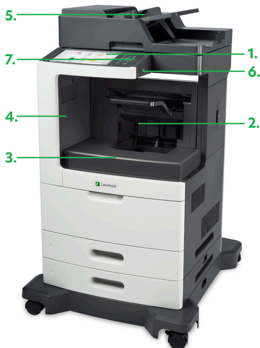
XM7263 model configured with Staple, Hole Punch Finisher