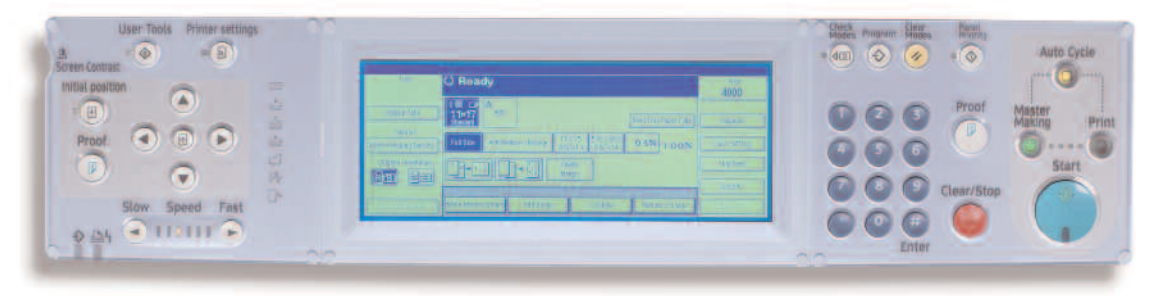
Large, bright LCD panel streamlines operation.

When timelines and budgets are equally tight, nothing makes more sense than the Savin 3580DNP Digital Duplicator. With its ability to produce high-quality, one- or two-color documents for a fraction of a penny per page, rugged reliability, and easy operation, it's the perfect in-house solution for your high-volume production jobs.