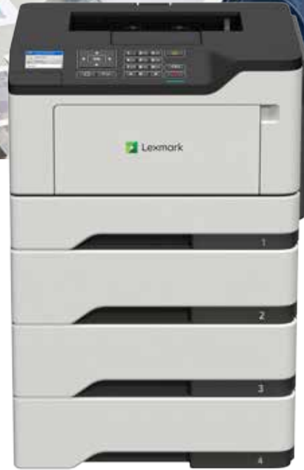
MS521dn with optional trays