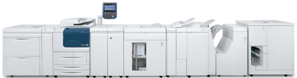
Xerox® D136 Copier/Printer shown with 2-Tray Oversized High-Capacity Feeder, GBC® AdvancedPunch™, High-Capacity Stacker, Standard Finisher Plus, Booklet Maker Finisher, Post Process Inserter and Tape Binder.