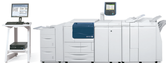
Xerox® D136 Printer shown with optional High-Capacity Feeder, GBC AdvancedPunch, Standard Finisher, Folder and Post Process Inserter.

Innovative production solutions to ensure a greener today and tomorrow.