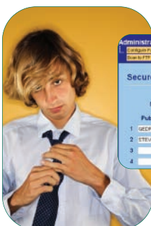
Intern Clearance: Copy only