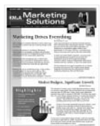
Output as 2 single sheets

The Brother MFC-8860DN provides all the features, convenience, versatility and performance of the MFC-8460N and adds built-in automatic duplex (two-sided) printing, copying, scanning* and faxing. This feature can help you cut paper costs by as much as half, while giving you the ability to create professional two-sided documents for reports, proposals and other tasks, quickly and easily.