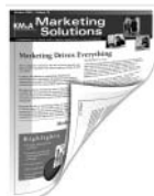
One double-sided (duplexed) sheet