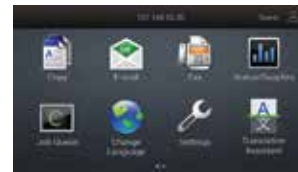
Easy to use interface

language from several choices, and receive a translated document within seconds. The translated documents can then be printed or emailed directly to recipients, streamlining and improving communications with customers, students, parents and constituents.