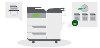
Translate hardcopy documents in seconds