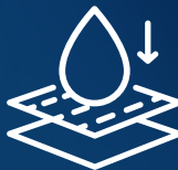
Reverse Osmosis Membrane

Reduces chlorine, chemicals, and pesticides.