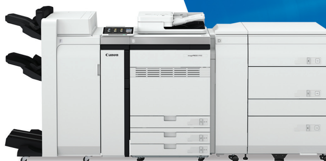
imagePRESS V900 shown with optional accessories.

Support for a Wide Range of Specialty Stocks**