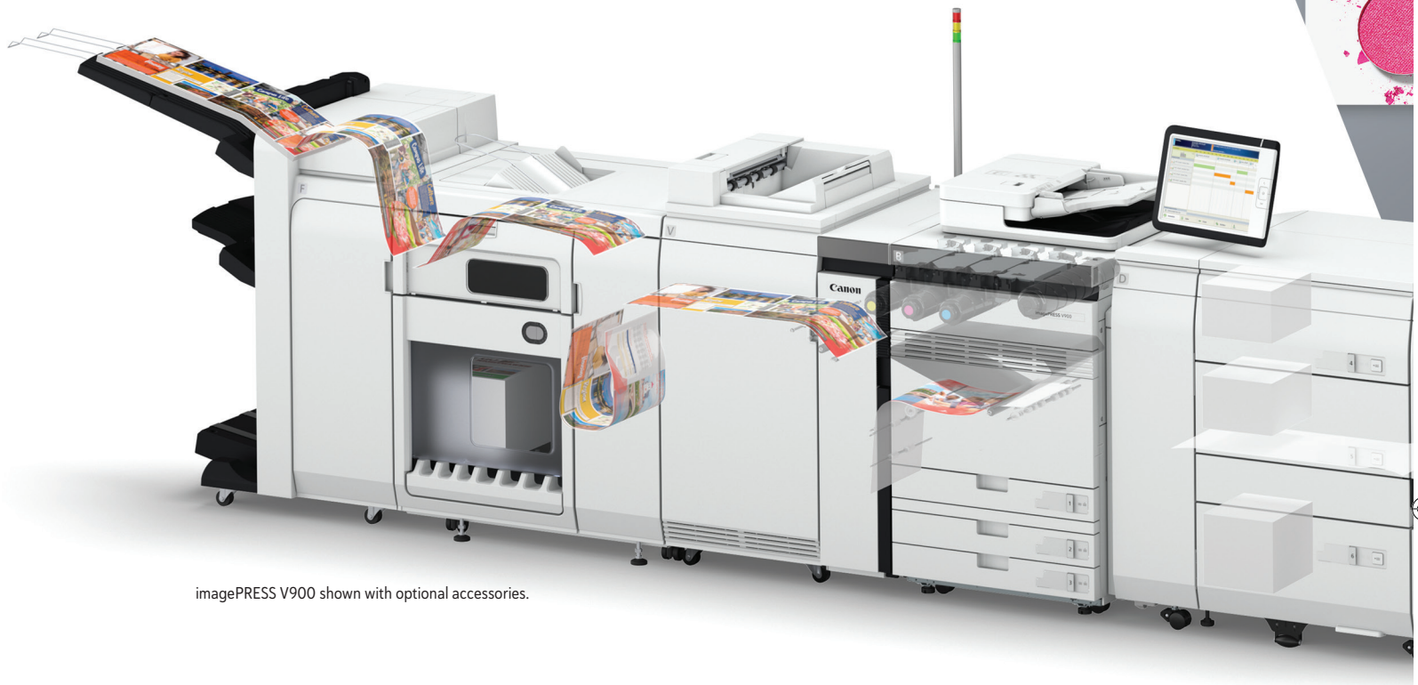
imagePRESS V900 shown with optional accessories.