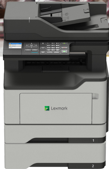
MB2338adw with optional tray