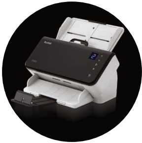
Kodak E1025 and E1035 Scanners

* Throughput speed may vary depending on your choice of application software, operating system, PC and selected image processing features.