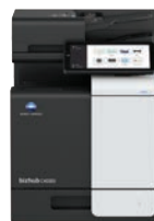
bizhub i-Series C4050i