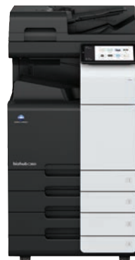
bizhub i-Series C360i