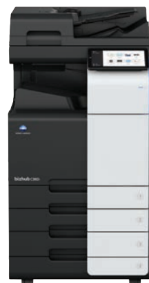
bizhub i-Series C360i