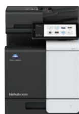
bizhub i-Series C4050i

To learn more, please visit workplacehub.konicaminolta.com