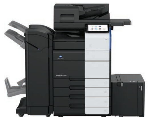
bizhub i-Series C650i