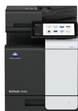
bizhub i-Series C4050i

To learn more, please visit workplacehub.konicaminolta.com