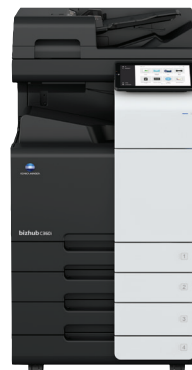
bizhub i-Series C360i