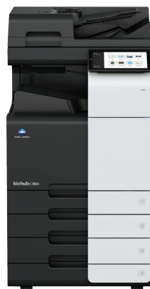
bizhub i-Series C360i