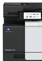
bizhub i-Series C4050i