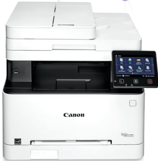
imageCLASS MF642Cdw Item Code: 3102C012