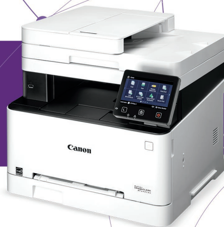
imageCLASS MF642Cdw shown.

Designed for small and medium-size businesses, the Canon Color imageCLASS MF642Cdw offers feature rich capabilities with high quality and minimal maintenance. Print, scan, and copy capabilities help you accomplish necessary tasks with just one machine. A 5" color touchscreen delivers an intuitive user experience and can be customized by a device administrator to simplify many daily tasks.