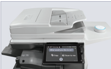
MX-M6071 shown with available Sharp MFP Voice feature with Alexa.