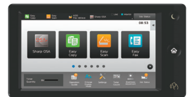
Award-winning 10.1" (diagonal) customizable touchscreen display.