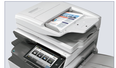
Sharp's ImageSEND™ feature provides one-touch distribution to email, cloud applications and more.