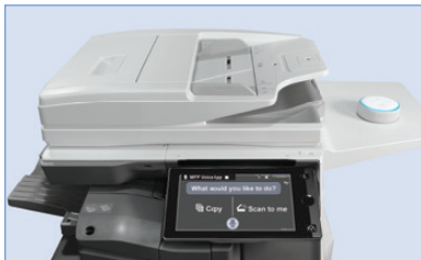
MX-M4071 shown with available Sharp MFP Voice feature with Alexa.