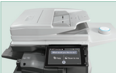
MX-M4051 shown with available Sharp MFP Voice feature with Alexa.