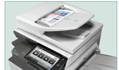
Sharp's ImagesEND™ feature provides one-touch distribution to email, cloud applications and more.